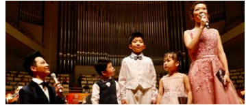
Celebrating the beauty of hearing.

On World Hearing Day, Sivantos China donated around 7,500 USD to the "Love Ears" concert put on by the China Symphony Orchestra. Children with hearing loss also performed songs and poems to an audience of around 2,000 in celebration of the beauty of hearing. The annual event is organized by the China Rehabilitation Research Center for Hearing and Speech Impairment. See more about China's engagement on page 12/13.