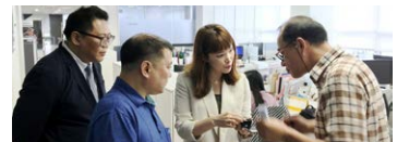
Excellent audit results in South Korea!

Our success continued in South Korea, where Sivantos obtained the best possible results in the Korean Goods Manufacturing Practice audit. The inspector even said that Sivantos has "one of the top QMS in the medical device industry in South Korea."