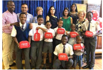
Singing together on World Hearing Day.