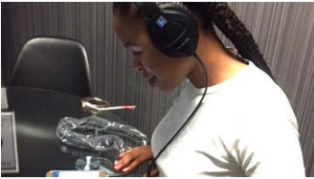
A South Africa employee gets screened.

Sivantos South Africa showed the importance of employees' hearing health and awareness by offering free screenings for all staff members. The screenings were also a way to improve their overall understanding of the specific field through firsthand experience.