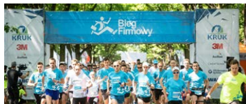
Off to the races!

Widex Poland employees participated in two runs for charity—the Wrocław Business Run and Bieg Firmowy. Reaching the finish line was especially rewarding, as participants achieved their personal goals and supported charities simultaneously.