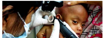
"Help for Little Ears" in Cambodia!

Signia started to support the German Lions "Help for Little Ears" project, providing those in need with 650 hearing aids in the first year. They are distributed to charitable aid organizations for suitable projects with the hard of hearing. On-site specialists fit the devices to each patient individually. Support for this project is long term.