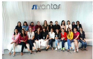
Empowering women at work!

The Women4Women@Work program at Sivantos Singapore was launched in March 2019. It's about providing a platform for women to develop skills, get equal opportunities, be empowered, and build self-confidence through mentoring, networking events, forums, and more.