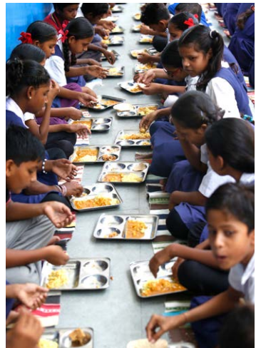
Enabling free meals for schoolchildren.

Millions of children in India are eager to attend school but are unable to do so due to poverty and hunger. The Akshaya Patra foundation provides free lunches to schoolchildren all over India. In 2018, Sivantos India supported this project by matching its previous year's donation of 15,500 USD, helping to feed more than 1,100 children in need in the Bellary area.