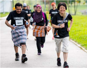
Bridging cultures through running.