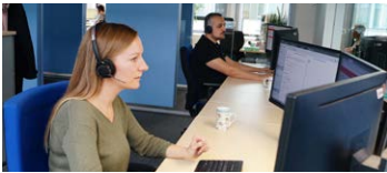
Saving 250,000 pieces of paper per year.

Since January 2019, our Sivantos Customer Service team in Germany has managed to digitize all internal order entry processes, saving around 250,000 pieces of paper per year. We are proud to continue to take steps to combat climate change and reduce our carbon footprint.