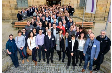
Participants at the Erlanger Colloquium